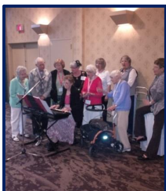
Enjoying the Sing-Along!