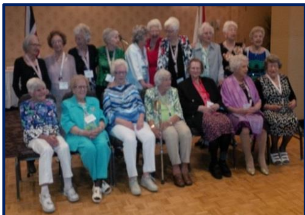
Our Lovely War Brides