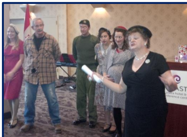
`Here come the War Brides` Cast