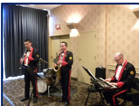
Dancing to the music of the Royal Canadian Artillery Jazz Task Force

Approximately 100 attended the reunion, with 57 of those registering for the weekend with the rest, attending individual events.